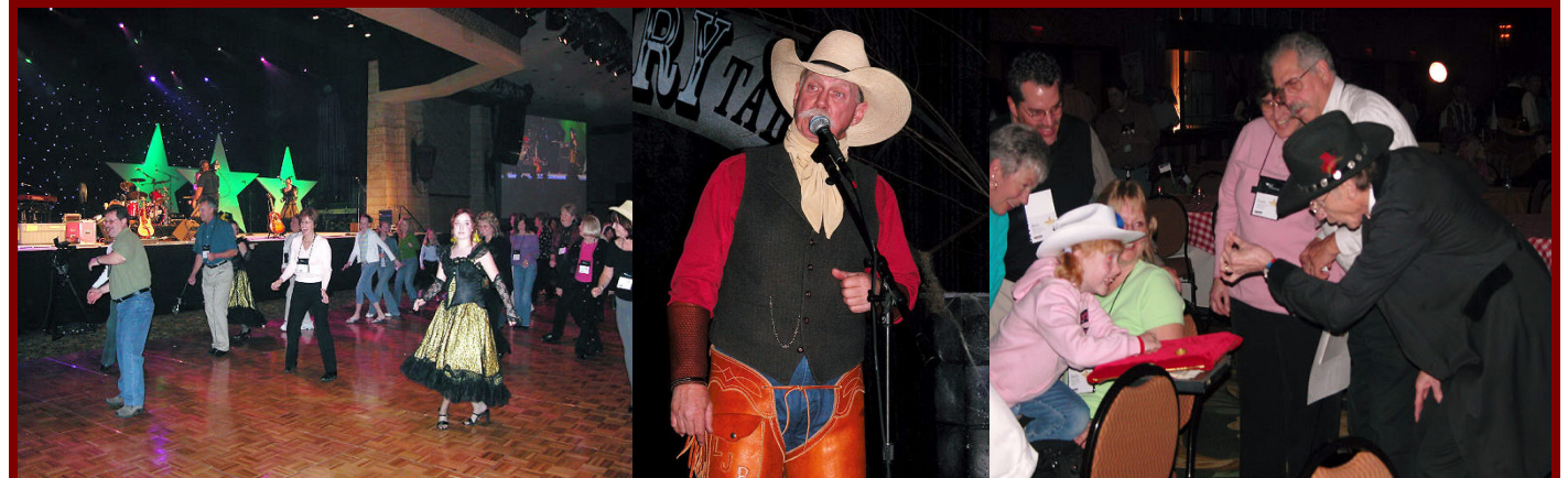
SALOON GIRLS TEACH GUESTS TEXAS LINE DANCES TEXAS STORY TELLER S<u>ilverado Star Express Publications February 7, 2005</u>

Silverado Ranch Productions, Dallas Texas provided the western entertainment / talent service for the Shaw flooring event and also coordinated and co-produced the 3 day western entertainment gala with The Wow Factory, an Atlanta Georgia based Production Company.